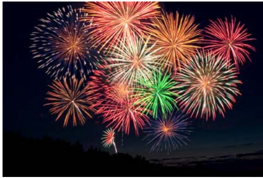
Firework for 11 October