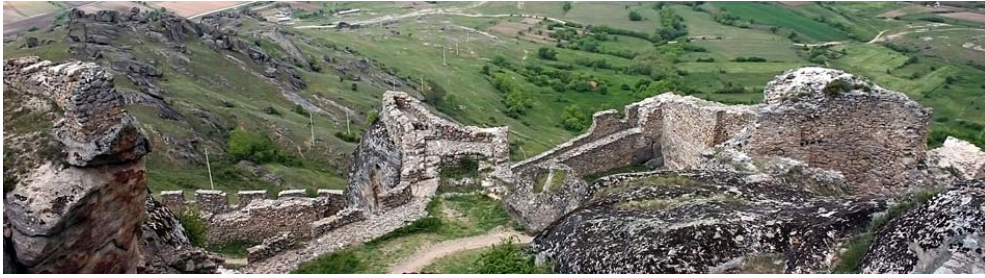
Markovi Kuli or Marko's Towers