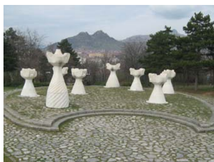
Park of the revolution-Mogila