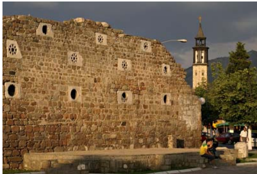
Center of Prilep